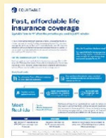
Client Case Study