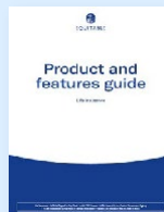
Product and Features Guide