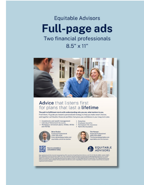
Full page ads for two FPs - 8.5" x 11"