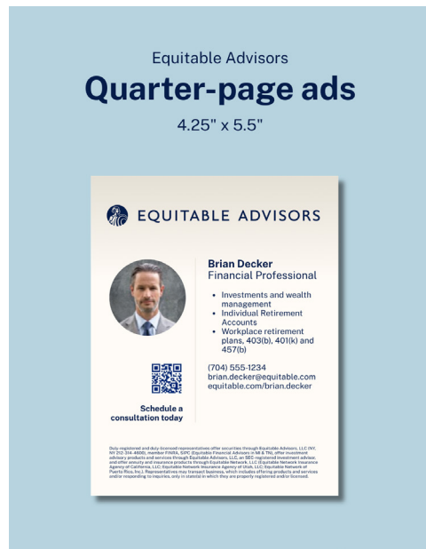
Quarter-page ads for a single FP - 4.25" x 5.5"