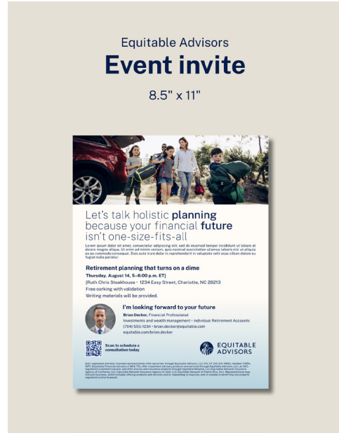
Event invite template - 8.5" x 11"