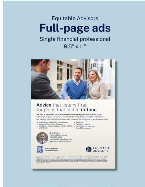
Full page ads for a single FP - 8.5" x 11"