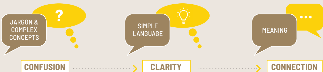
EXHIBIT A. Effective Financial Communication

Where things often get tricky is the "how" stage - choosing which types of investments to achieve their goals. The investment industry tends to use a lot of jargon and complex visuals, which can often feel like a whole new language. Too few of us grew up in families that could teach strong money skills or even had access to personal finance classes in school . 3 Often, we learn as we go. Fortunately, the language of money is just like learning any other language. By starting with the basics and some effort, plus a good translator , (Exhibit A) you eventually become conversant. Financial literacy is a process- it takes time, practice and patience. Women who commit to this journey are in a better position to be good builders, as well as stewards, of their wealth. Research has also found that financial knowledge is a strong predictor of retirement planning behavior which can be especially important for women. 4 And the added reward for this effort? Many more women can achieve financial security and independence for themselves and their families.